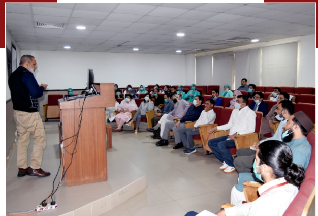
Neurosurgery & Radiology Workshop