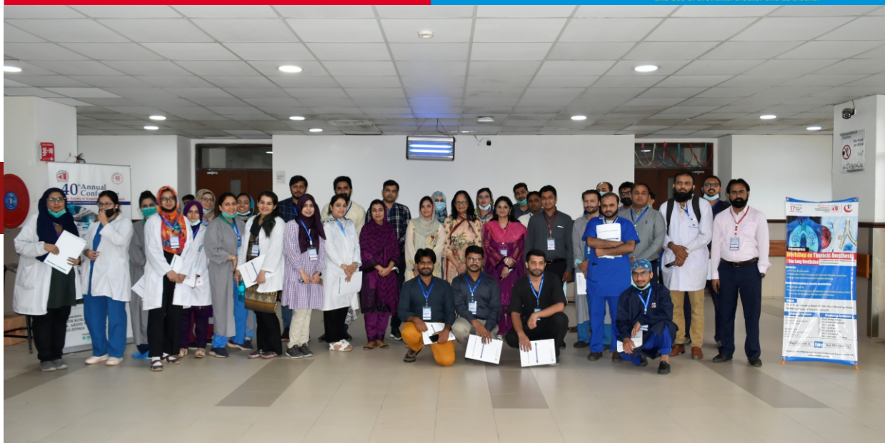
Workshop on Thoracic Anesthesia / One Lung Ventilation Group Picture